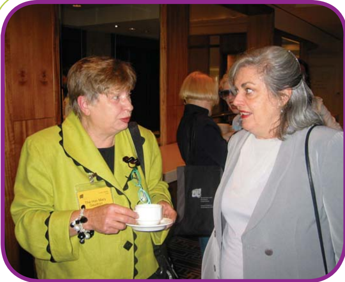
Mary Gaudron QC, Justice Susan Crennan

* Recent issues in privilege. Corporate Governance Chief Justice Marilyn Warren AC