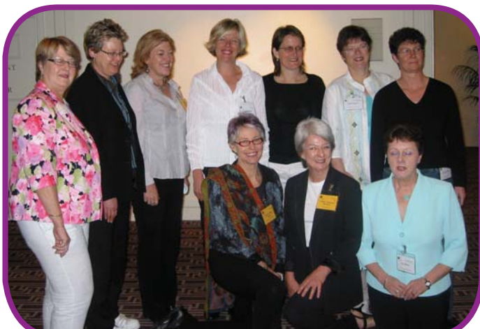
SA women at the conference