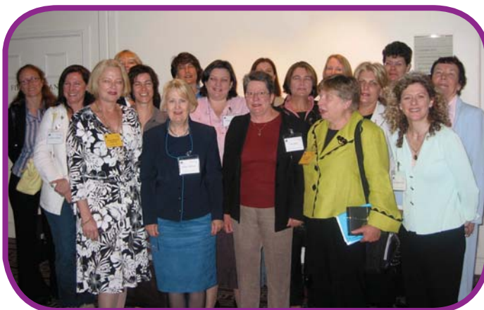
Queensland women at the conference